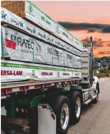
Serving Lumber & Building Material Dealers for over 60 years